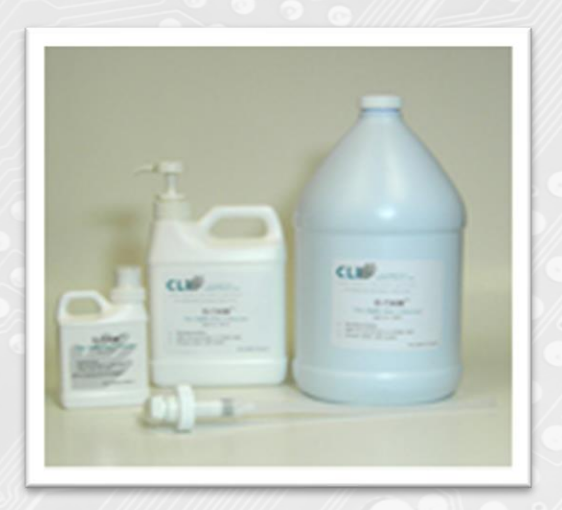
Skin Cleaner & Cleaning Solutions

SWYPEs detect minute amounts of substances that are too small for the eye to see. The chemically impregnated paper changes colors in the presence of certain chemicals. They help identify the cleanliness of an area before the work starts. Skin cleansing and surface cleaning chemicals available as well.